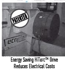
Energy Saving HiTorc™ Drive Reduces Electrical Costs