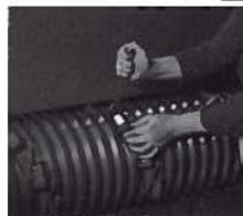
Easy Access to Wear Items Reduces Maintenance Costs